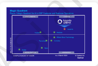
Leader in the Gartner Magic Quadrant for AI in CSP Customer and Business Operations, 2024